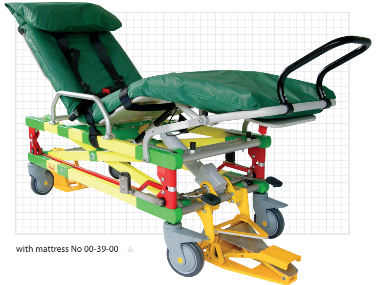
with mattress No 00-39-00 ▲