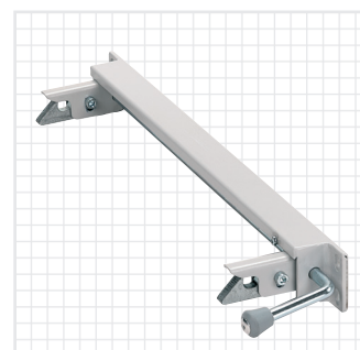
▲ wall fastening