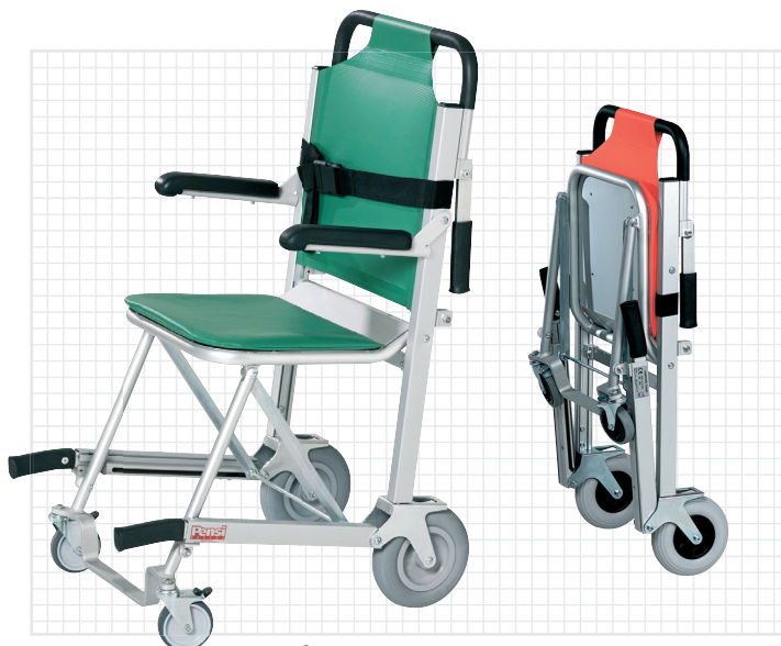
▲ model 41-11-00 with front wheels

The products fulfils the requirements of EN1865.