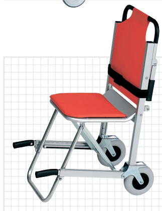
▲ model 41-10-00 with foot support