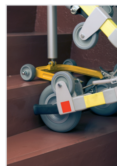
Stair cylinder 32-70-00 ▶

Use of damaged product is strictly forbidden.